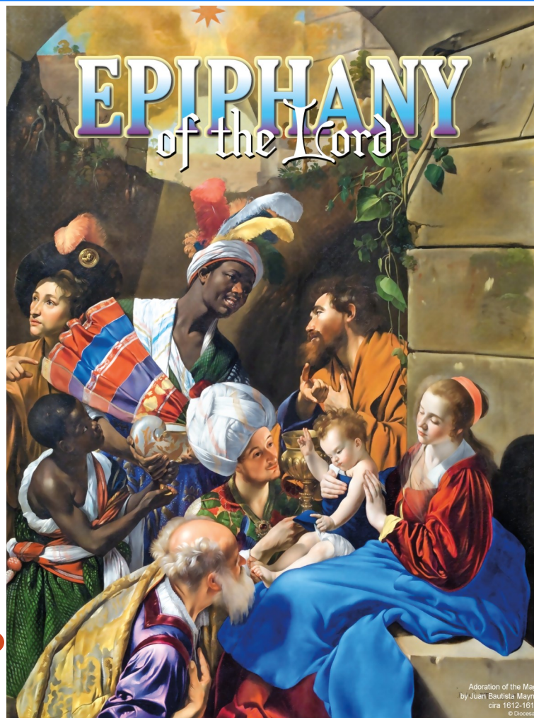
Adoration of the Magi by Juan Bautista Maeyne c. 1612-1614