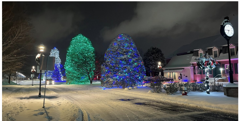
Downtown Dover on January 6, 2025